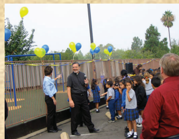
Playground Dedication 2011