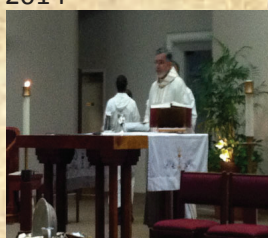
Mass of the Lord's Supper 2014