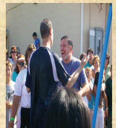
Festival 2006 Water Wars