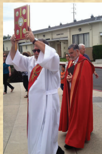
Palm Sunday 2014