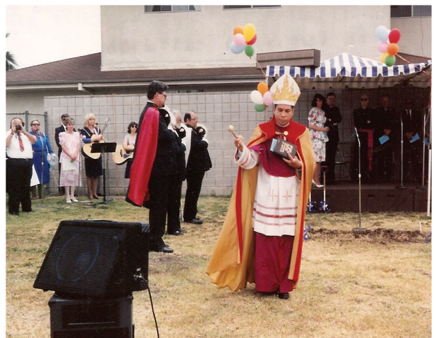
Ground Blessing by Bishop Carl Fisher for new church (May 1990)