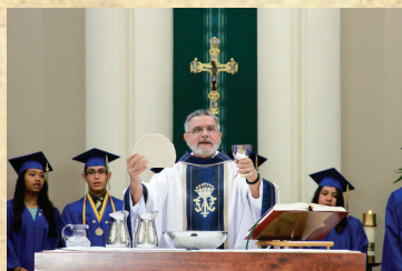
8th Grade Graduation 2014